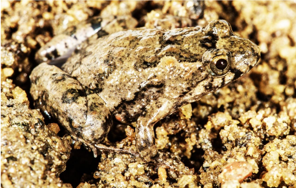
Figure 1. Pseudopaludicola pocoto collected in municipality Aiuaba, Ceará, Brazil.

evolution history of the genus in the Caatinga, a biome of a diverse and complex evolutionary history of its biodiversity (Werneck et al. 2015; Thomé et al. 2016).